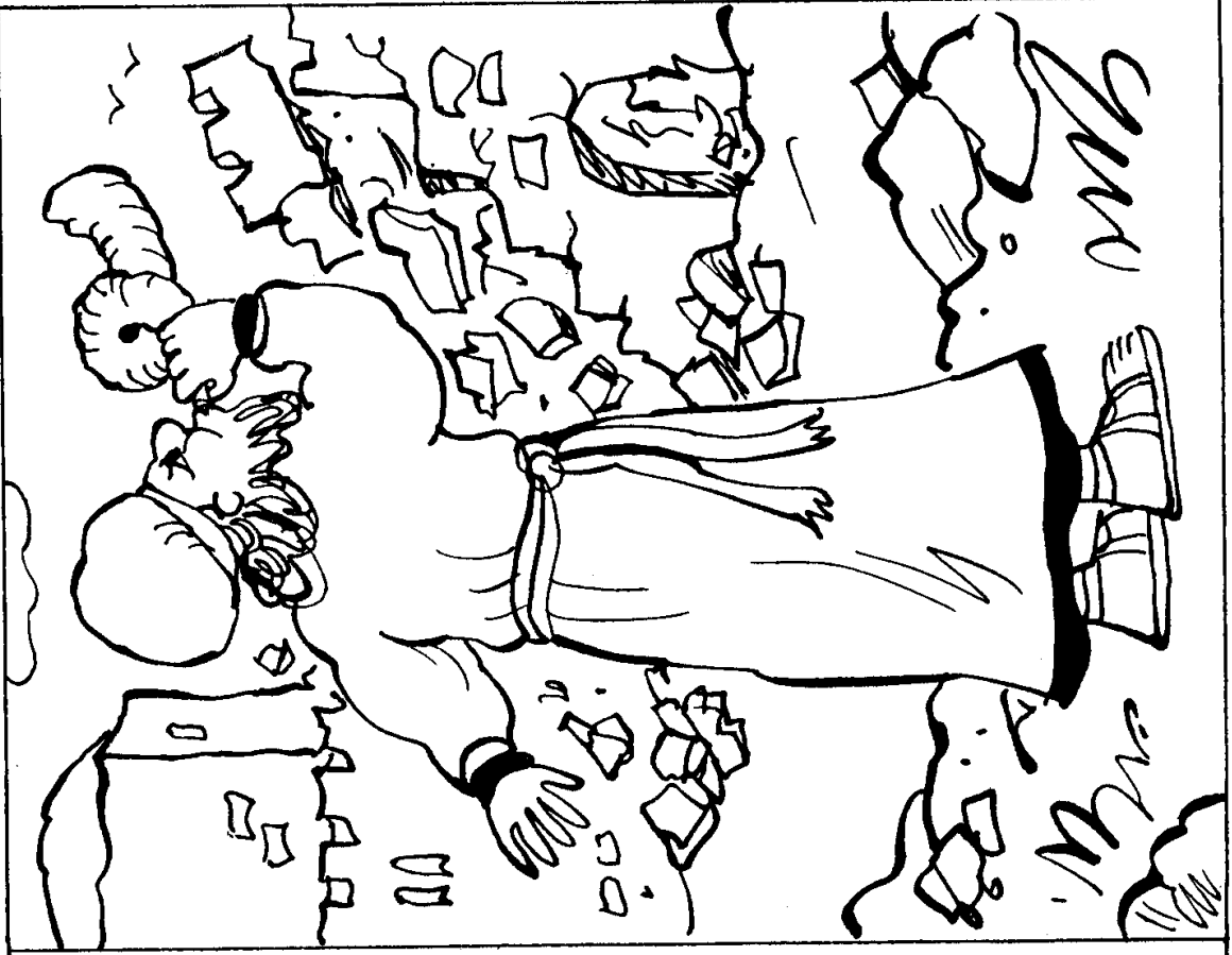
Spot 10 differences